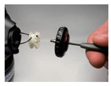
Closure system of steel Lace, nylon guides and a mechanical reel. Simple and highly durable. **Different system on RSS009