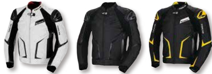
WHITE/BLACK BLACK BLACK/YELLOW